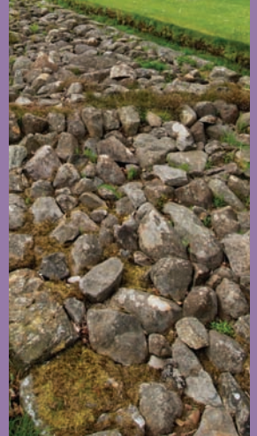
New Kilpatrick Cemetery